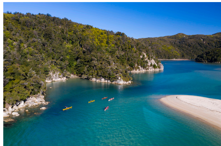
Abel Tasman National Park

Nelson is surrounded by 3 National Parks (Abel Tasman, Nelson Lakes and Kahurangi) and there is easy access to the calm and tranquil waters of Tasman Bay.