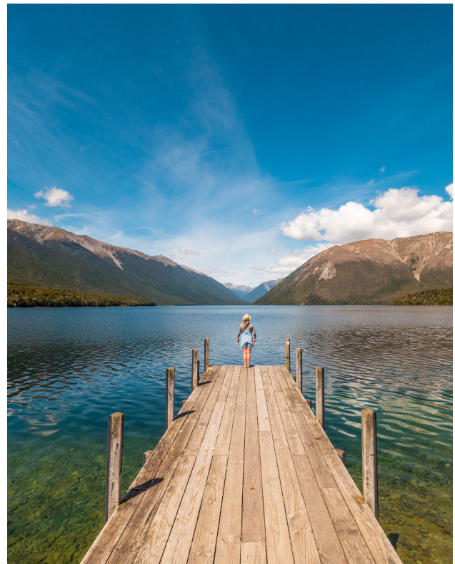
Lake Rotoiti, Nelson Lakes National Park

We are very glad you are coming to New Zealand and spending time in one of our schools. We hope you enjoy your time here, learn something new and make new friends.