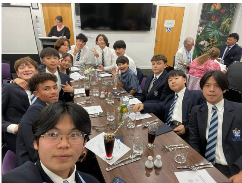
End of Year boarding dinner