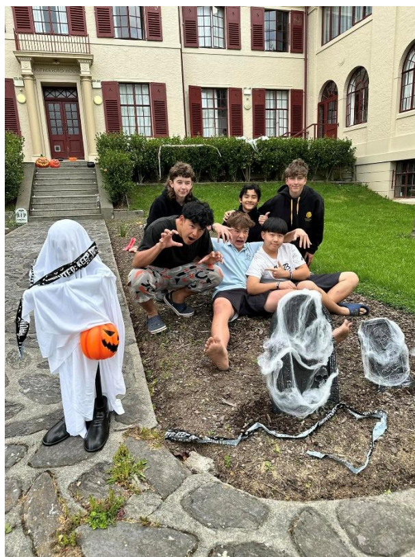
Halloween celebrations for the local community