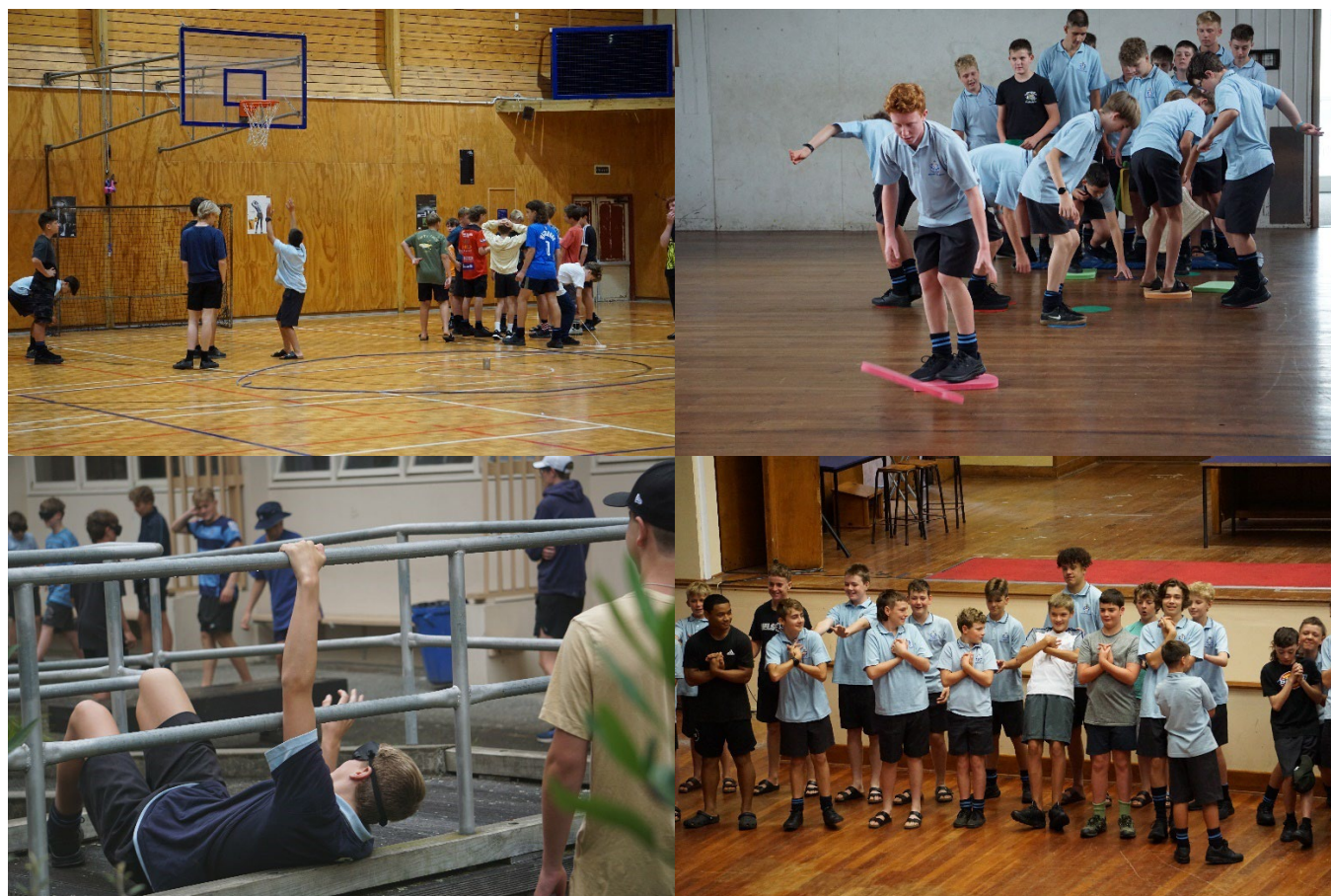
Trustfalls and basketball – the boys get to know each other during The Big Day In