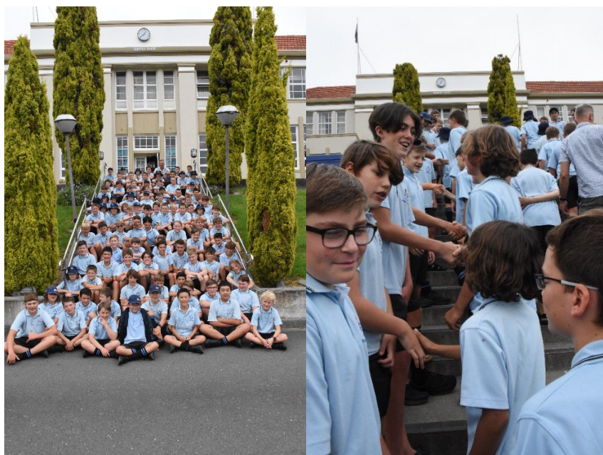
Year 7 prep students fill the front steps of the college and, as per tradition, and then exchange a quick handshake.