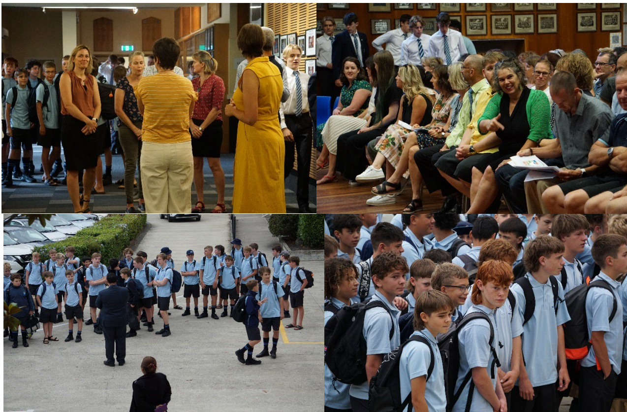
Staff and students assemble for the Mihi Whakatau