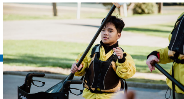
Outward Bound Adapted Courses