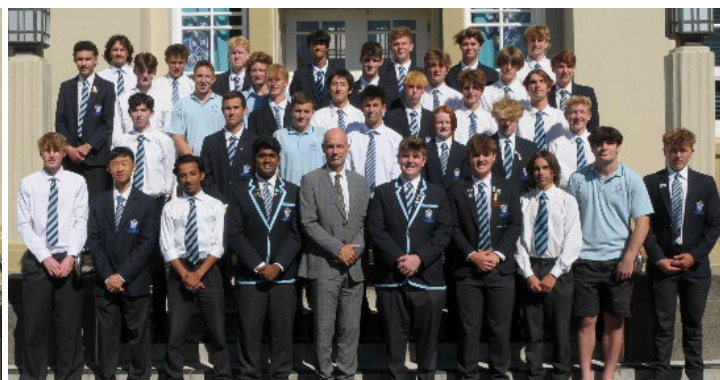
Level 1 Colours – NCEA Level 2 with Merit