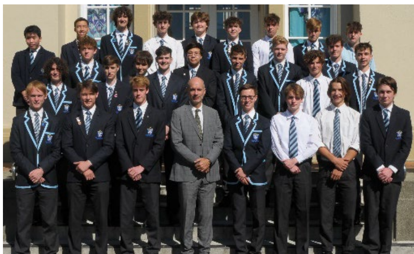
Level 2 Colours – NCEA Level 2 with Excellence