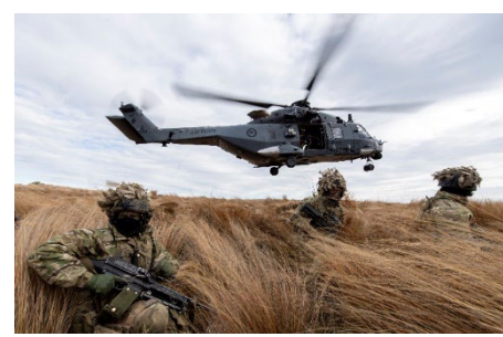
Top: Luke with fellow OB, Sean Allan. Bottom: Luke and two comrades being dropped on an objective.